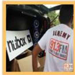
NuBox Car Decal Giveaway at East Coast