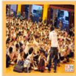
The RHB Straits Times Recess Express at