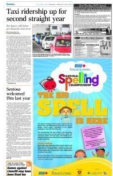
The Straits Times 15 February 2012