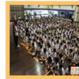
The RHB Straits Times Recess Express at SJI