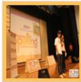
Recess Express at Eunos Primary School