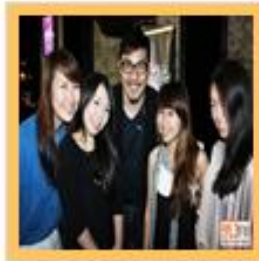
Must Drink Friday 'The Hottest Club Look'