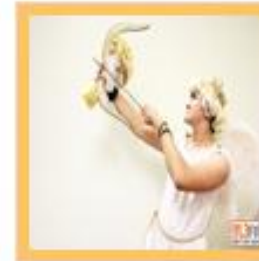
91.3FM Romance Repair Crew