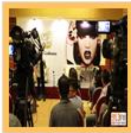
Jessie J Press Conference