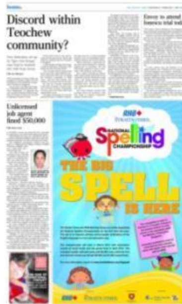
The Straits Times 01 February 2012