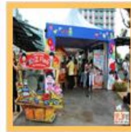
Sentosa Kidz Flea Market